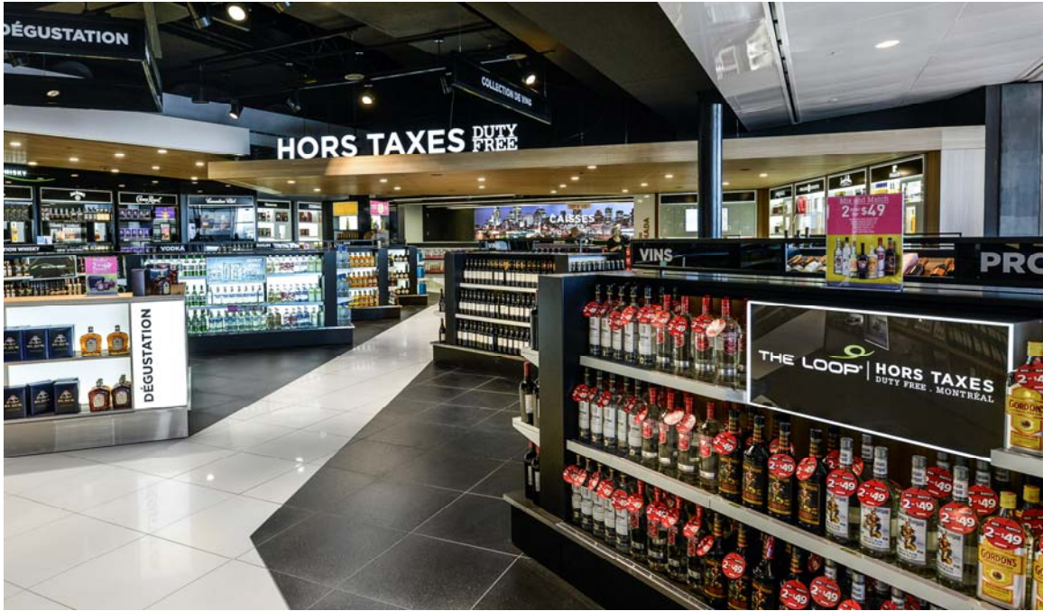
The airport duty-free shop completely redesigned in a contemporary style