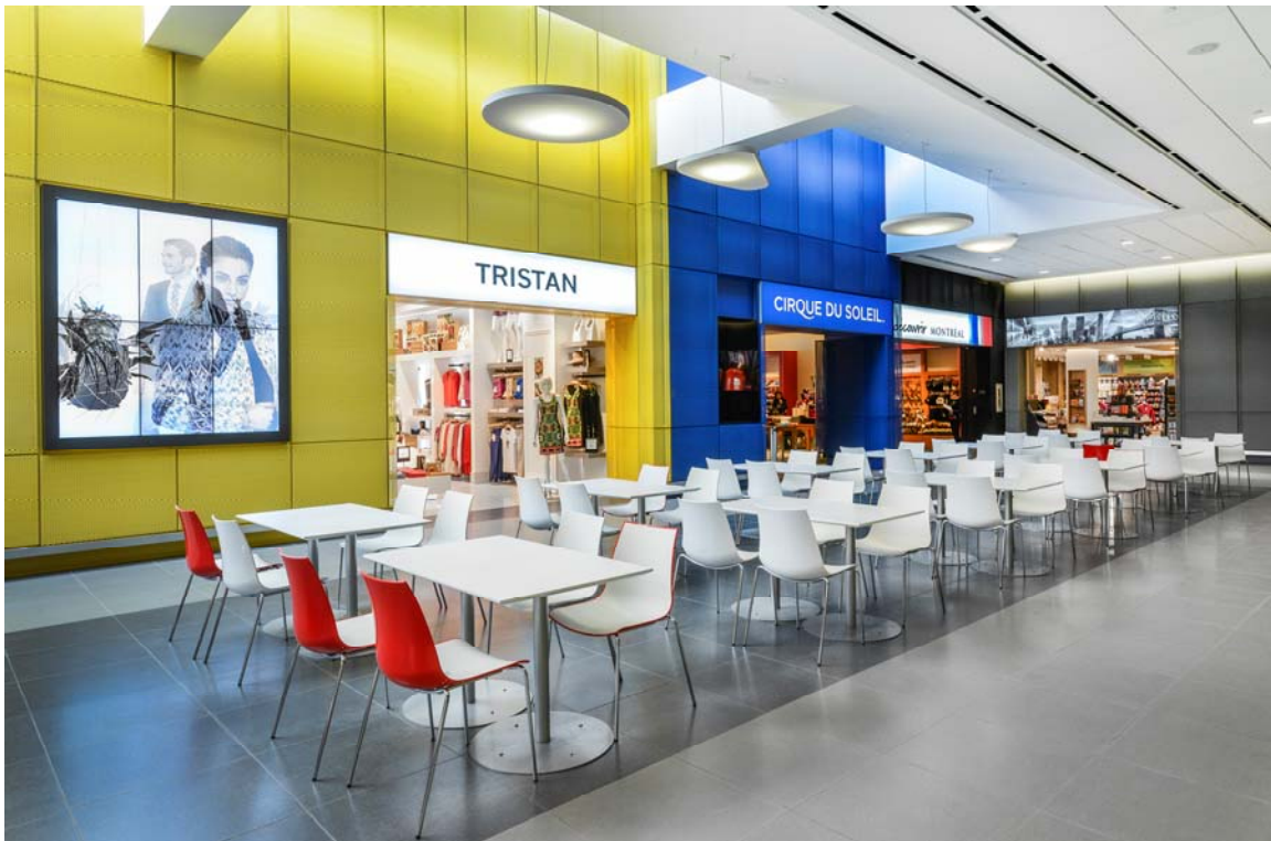
Part of the new commercial area at Montréal-Trudeau Airport